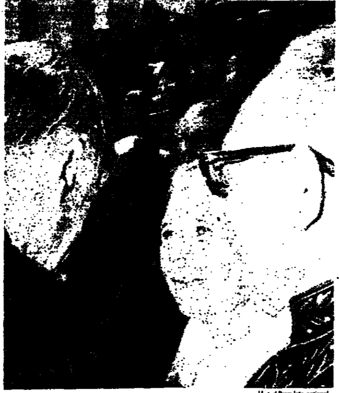
President Giscard d'Estaing congratulates novelist Marguerite Yourcenar as she arrives at the Academie Francaise Thursday for a welcome from academicien Maurice Schumann, right.

The main part of Miss Yourcenar's address, as tradition dictates, was devoted to the academy member — Roger Caillois — whose death created the vacancy that she fills. What the public, the press and the president had mainly come for was the prologue. She smiled kindly as she delivered it, but the kindness had a hint of judgment to it.